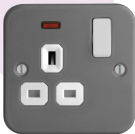
Heavy duty Metal Clad design.