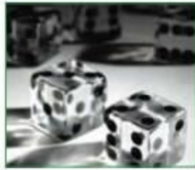
22,000:1 Contrast Ratio