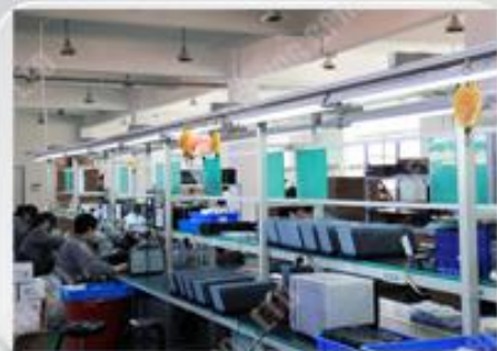
QC WORK SHOP