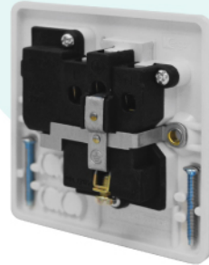
Angled captive terminal for easy installation.