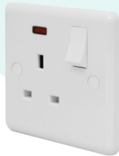
Curved profile design.