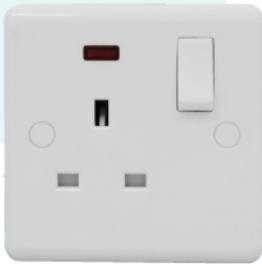
High quality UREA thermoset material.