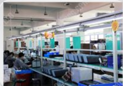
QC WORK SHOP