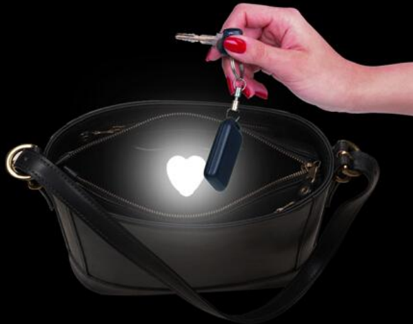
Clip in handbag