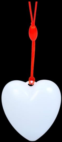
Hang in the handbag