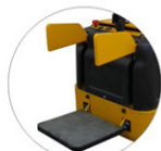
踏板扶手 Pedal and Handrail