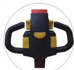
F型手把 F Type Handle