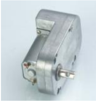
Model:KM-38L180 Spur Gear Motor