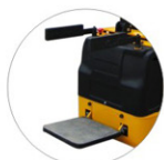
踏板扶手 Pedal and Handrail