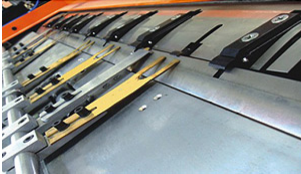
Back Lay , Gripper

The ASP screen printing machine in line with SCT dryer and stacker, meets the requirements of the finishing and packaging as well as the standard transfer printing industries.