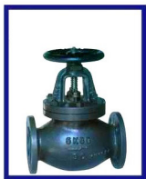
Marine Cast Steel Globe Valve JIS F7311 5K Marine Cast Steel Screw Down Check Globe Valve JIS F7311C 5K