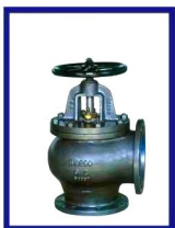
Marine Cast Steel Angle Valve JIS F7312 5K Marine Cast Steel Screw Down Check Angle Valve JIS F7312C 5K