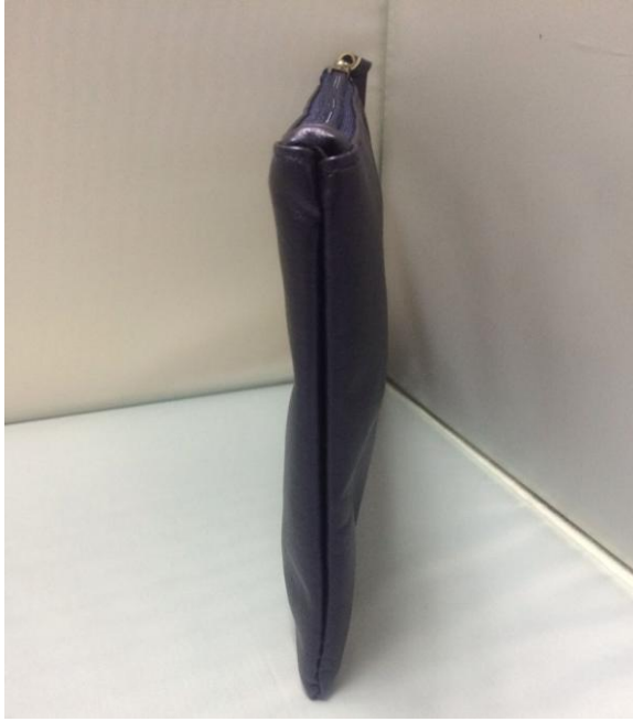
Back and side view