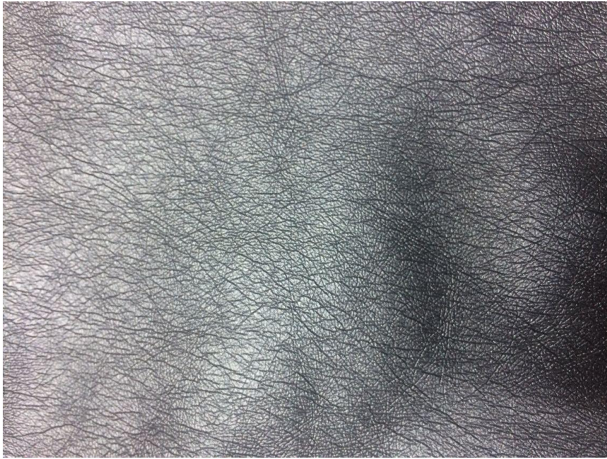
Material: high quality PU leather