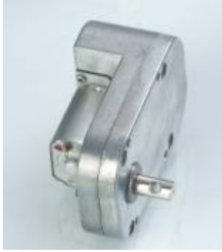
Model:KM-38L130 Spur Gear Motor