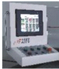
Soft touching display menu, clear and easy control