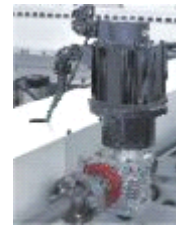
Perfect performance of PANASONIC servomotor and controlling system High precision of worm gear box made in Swiss