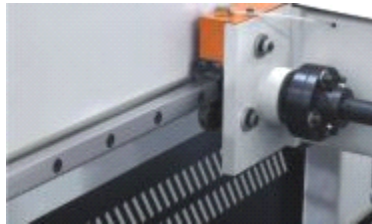
High precision pinion and rack made in Swiss