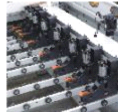
Perfect feeding plier driven by air