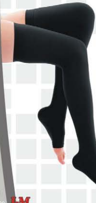
A-6002 Alina Over Knee Open Toes Size : S, M, L, XL, XXL Color : Black & Beige Compression : 15-20 mmHg 20-30 mmHg 30-40 mmHg