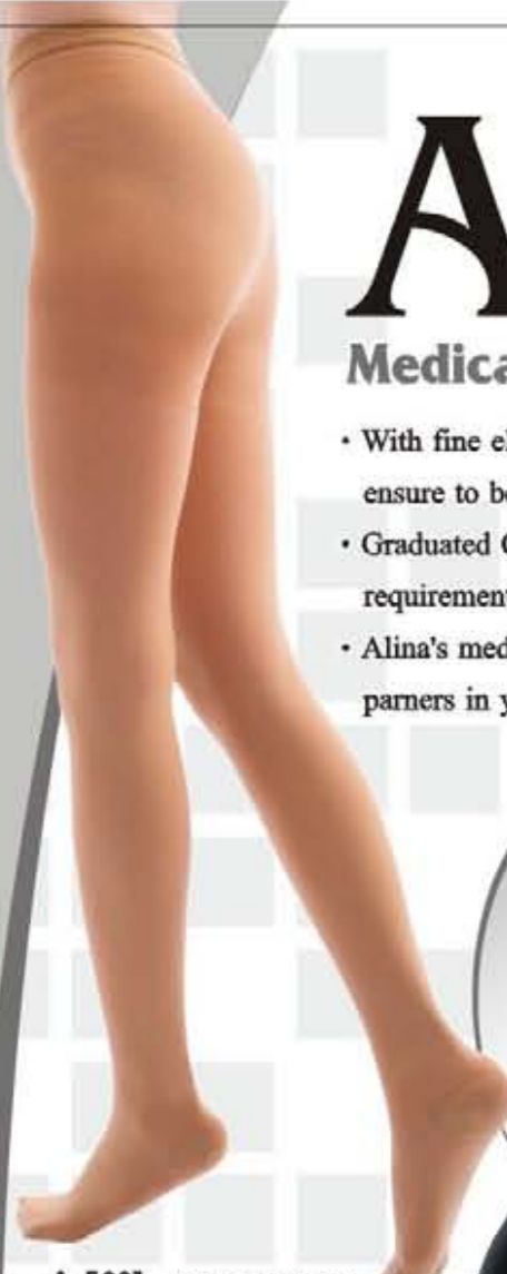
A-5001 Alina Pantyhose Size : S, M, L, XL, XXL Color : Black & Beige Compression : 15-20 mmHg 20-30 mmHg 30-40 mmHg