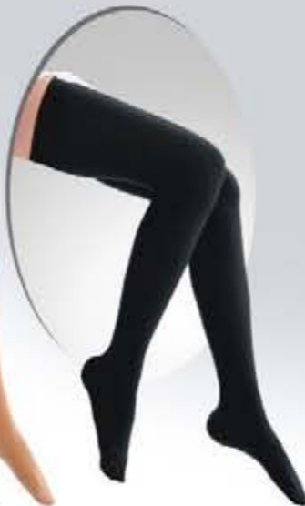
A-6001 Alina Over Knee Close Toes Size : S, M, L, XL, XXL Color : Black & Beige Compression : 15-20 mmHg 20-30 mmHg 30-40 mmHg