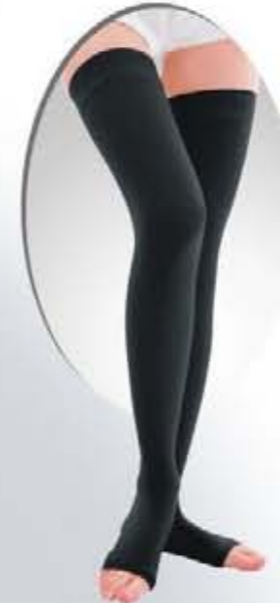
A-6004 Alina Over Knee Open Toes w/ Silicone Anti-slip Size : S, M, L, XL, XXL Color : Black & Beige Compression : 15-20 mmHg 20-30 mmHg 30-40 mmHg