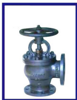
Marine Cast Steel Angle Valve JIS F7320 10K Marine Cast Steel Screw Down Check Angle Valve JIS F7472 10K