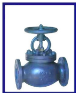
Marine Cast Steel Globe Valve JIS F7319 10K Marine Cast Steel Screw Down Check Globe Valve JIS F7471 10K