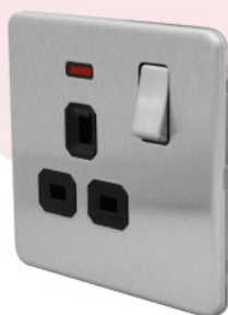
Ultra slim profile design, with high quality metallic switch.