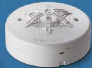
QA06 Addressable Heat Detector