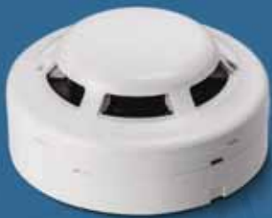
QA01 Addressable Photoelectric Smoke Detector