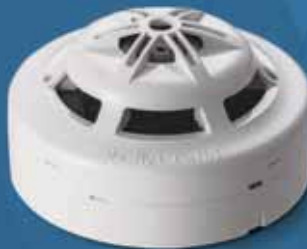
QA05 Addressable Combination Smoke & Heat Detector