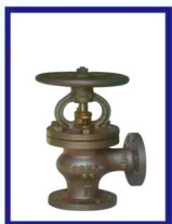
Marine Cast Steel Angle Valve JIS F7314 20K Marine Cast Steel Screw Down Check Angle Valve JIS F7474 20K