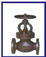
Marine Cast Steel Globe Valve JIS F7313 20K Marine Cast Steel Screw Down Check Globe Valve JIS F7473 20K