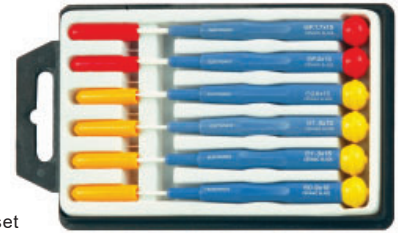
SN74061 Ceramic alignment tool set 6pcs