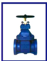
Marine Cast Iron Gate Valve JIS F7363 5K Marine Cast Iron Gate Valve JIS F7364 10K Marine Cast Iron Gate Valve JIS F7369 16K