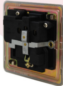
Integral gasket for moisture protection.