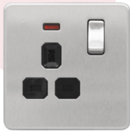
Screwless design, easy clip on cover.