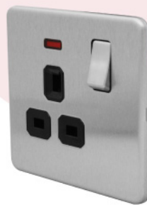
Ultra slim profile design, with high quality metallic switch.