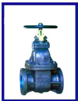
Marine Cast Steel Gate Valve JIS F7363C 5K