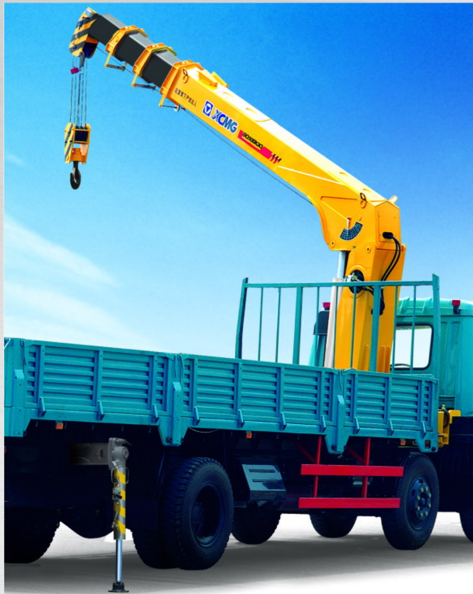
起重机外形尺寸 CRANE OUTSIDE MEASUREMENT