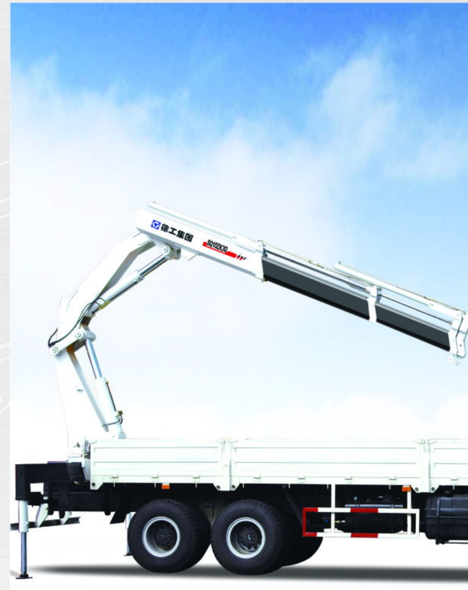
起重机外形尺寸 CRANE OUTSIDE MEASUREMENT

上述参数为改装后参数，更多配置底盘请咨询当地销售经理。 The above parameters are for refitted models, for more chassis options for refitting sake please consult the local sales manager.