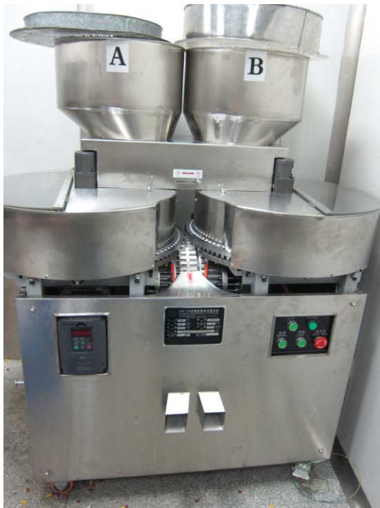
6) Printing machine