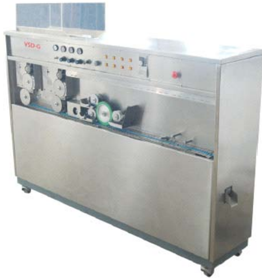
7) Inspection table

Tel.: 0086 21 33522115, 0086 021 33522116, 0086 021 33522127 Fax: 0086 21 33522135 E-mail: spm@pharmach.com