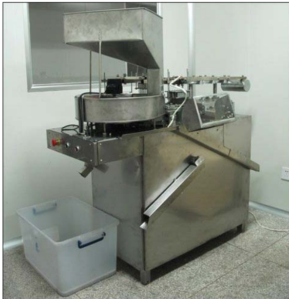
5) Joining machine

Tel.: 0086 21 33522115, 0086 021 33522116, 0086 021 33522127 Fax: 0086 21 33522135 E-mail: spm@pharmach.com