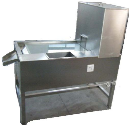
8) Grind for titanium dioxide