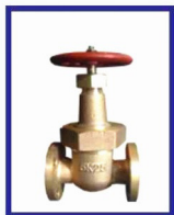
Marine Bronze Rising Stem Type Gate Valve JIS F7367 5K Marine Bronze Rising Stem Type Gate Valve JIS F7368 10K