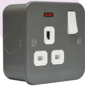
Durable powder coated surface, with UREA switch.