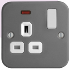
Heavy duty Metal Clad design.