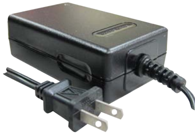
FIG 2: 2PIN American