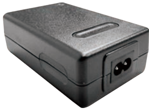
FIG 1: IEC-320-C8