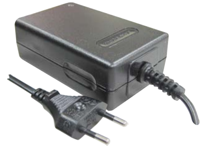
FIG 3: European