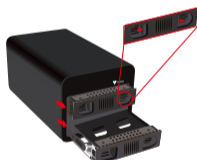
Pull out the hard drive from the unit