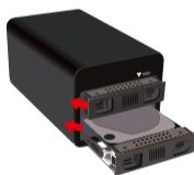
Install the hard drives into the trays and put it back to the unit