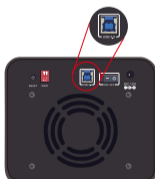
Connect the USB Type C connector to the unit