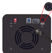
Connect the power connector from the power adapter, and plug the power adapter to the power source