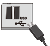
Connect the USB cable to the computer