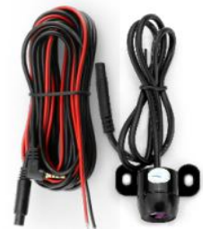
Rearview Camera (optional)