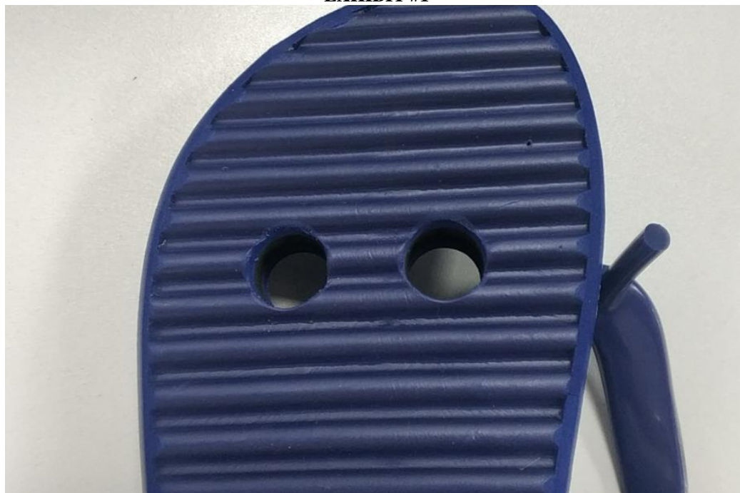
ABRASION RESISTANCE FOR OUTSOLES