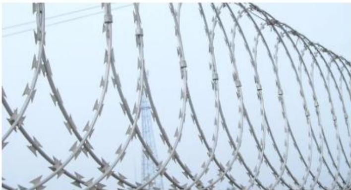
Concertina Wire Tape

Razor Blade Type: BTO-10, BTO-12, BTO-22, BTO-30