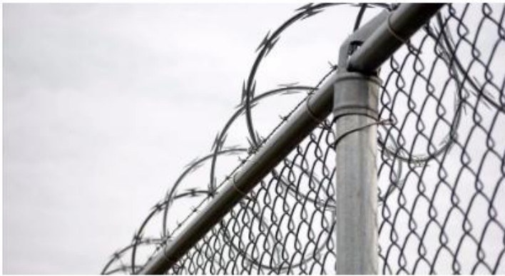
Single Concertina Wire Coil