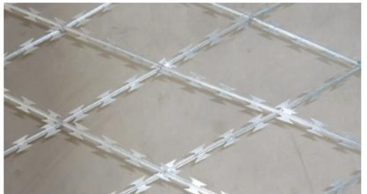
Welded Concertina Wire Fence

Razor Blade Type: BTO-10, BTO-12, BTO-22, BTO-30