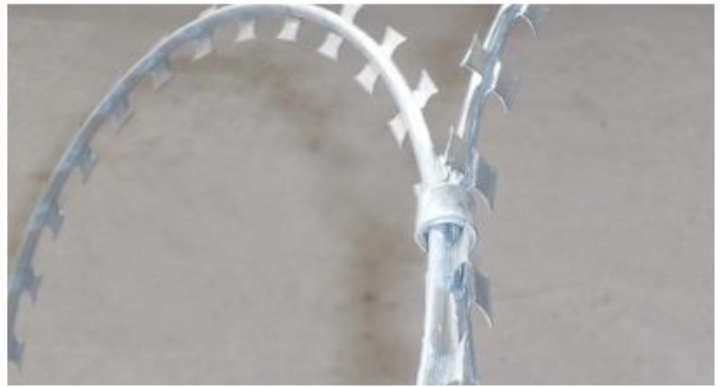
Cross Concertina Wire Coil

Razor Blade Type: BTO-10, BTO-12, BTO-22, BTO-30