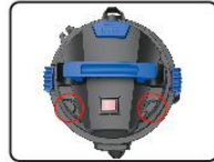
Accessories storage function