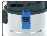
Durable plastic clips