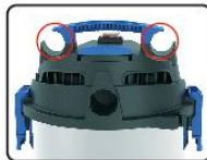
Hose storage function