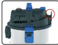
Cable storage function