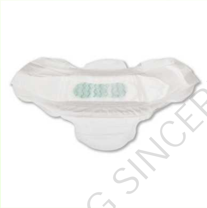
with 3D leak guard