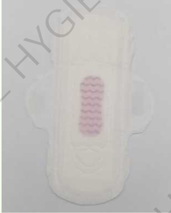
with anion chip