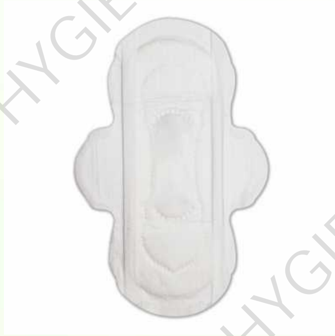
with 3D leak guard