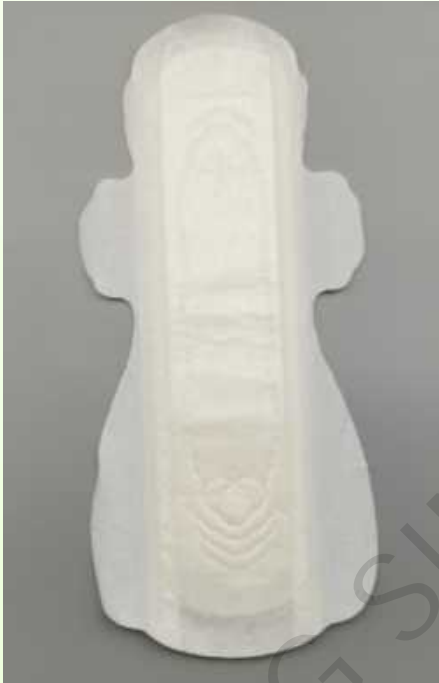
Ultra thin type