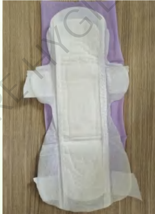
thick fluff type