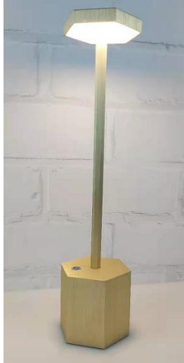
Table lamp specification: