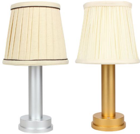
Table lamp specification: