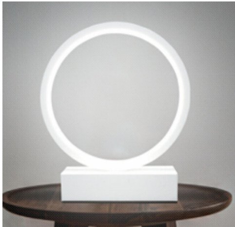
Table lamp specification: