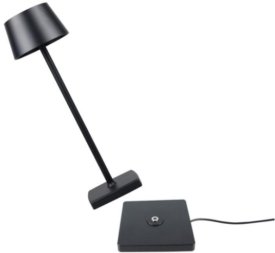
Table lamp specification: