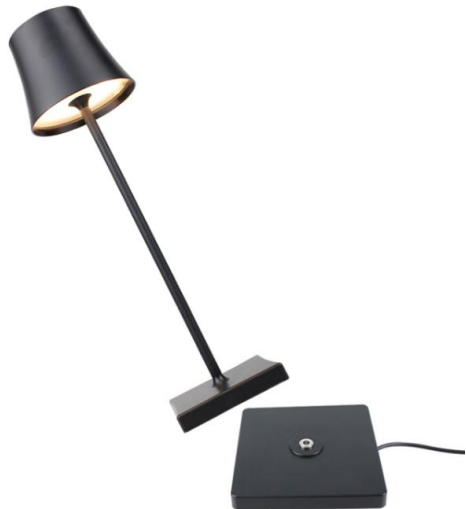
Table lamp specification: