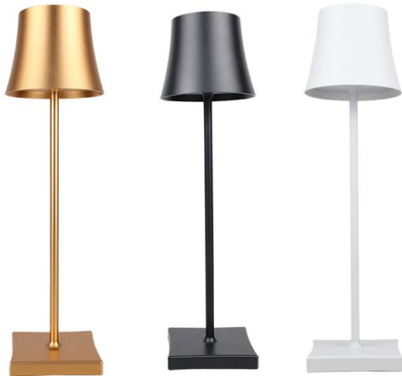
Table lamp specification: