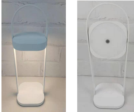
Table lamp specification: