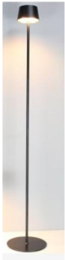
Table lamp specification: