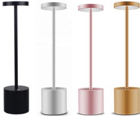
Table lamp specification: