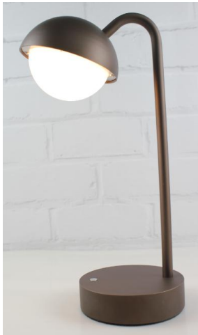
Table lamp specification: