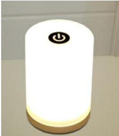
Table lamp specification: