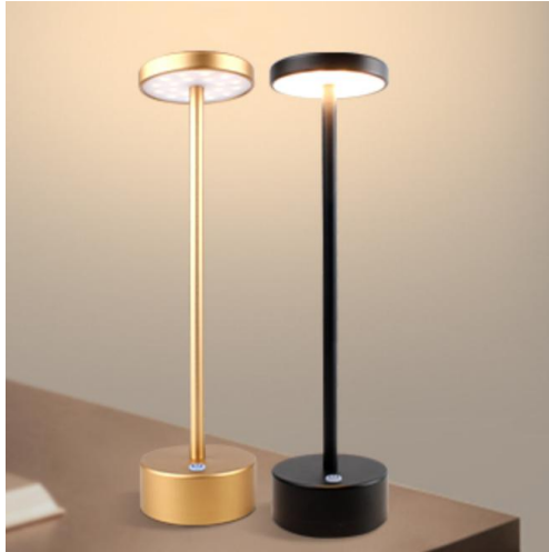
Table lamp specification: