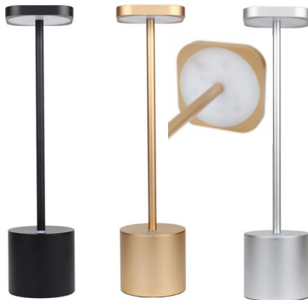
Table lamp specification: