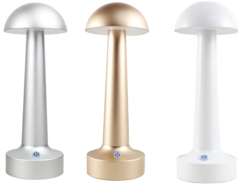
Table lamp specification: