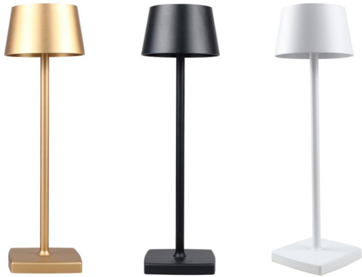
Table lamp specification: