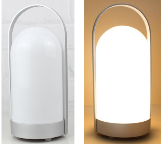
Table lamp specification: