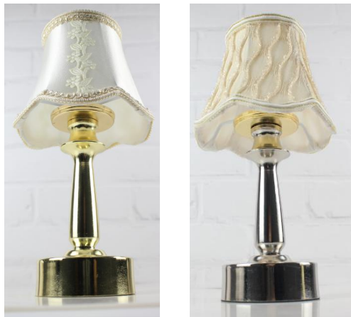
Table lamp specification: