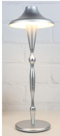
Table lamp specification: