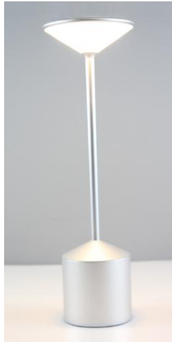
Table lamp specification: