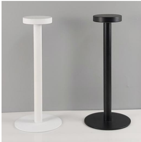
Table lamp specification: