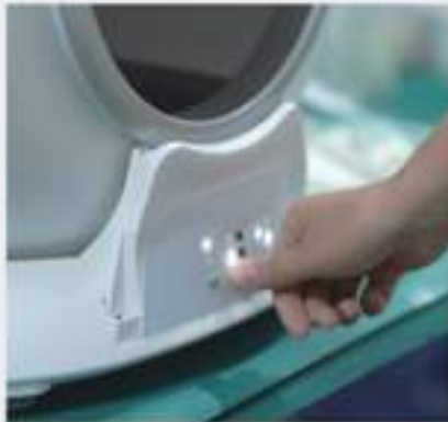
Product Quality Inspection