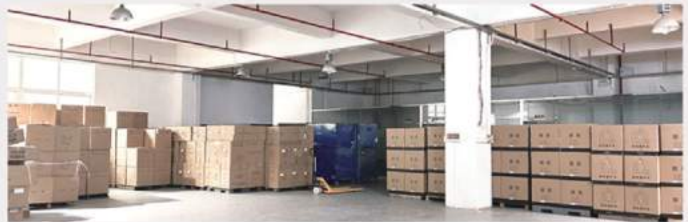
5000m 2 Warehouse Area