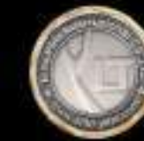
Curve wave edge