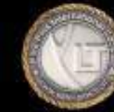
Rope line edge