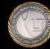
Oblique line edge