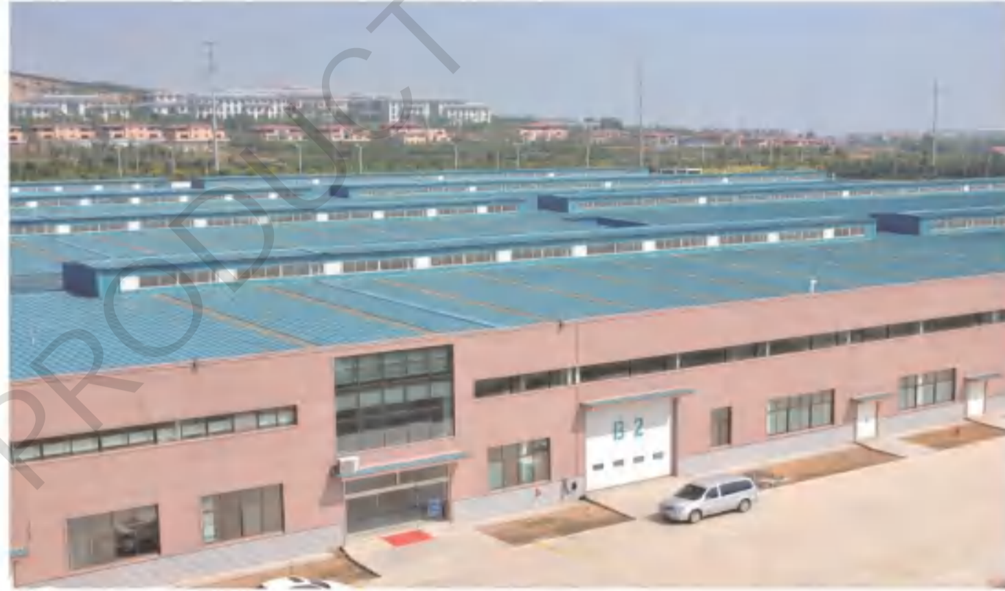
INTERNATIONAL ADVANCED MANUFACTURING EQUIPMENTS AND PRODUCTION TECHNOLOGIES.