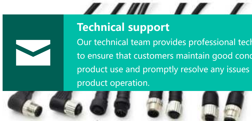
Customization of connectors and cables