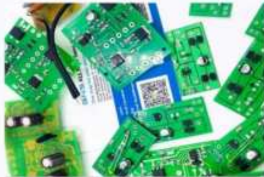
IC label card customization