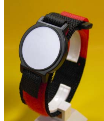
w/ Nylon + Velcro Band