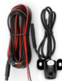
Rearview Camera (optional)