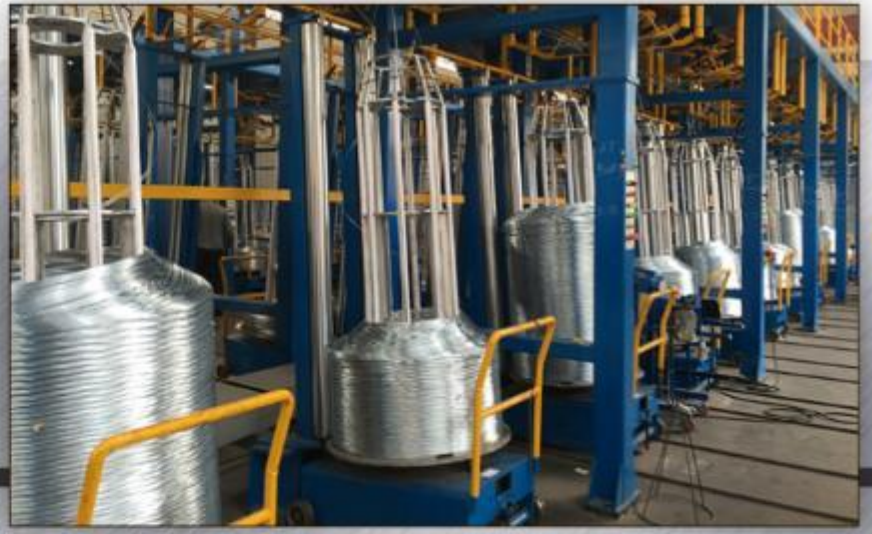
GALVANIZED STEEL WIRE