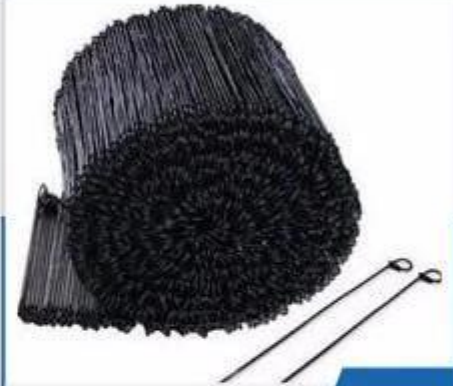
loop tie wire