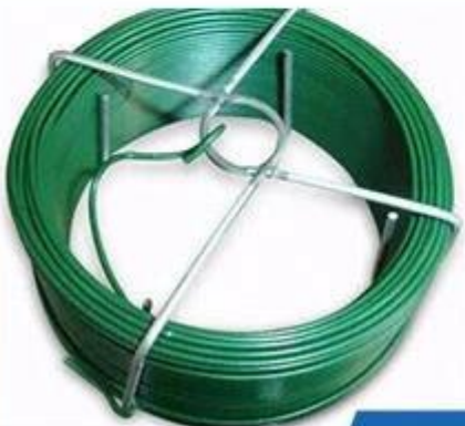
PVC coated wire