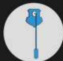
Brooch Pin 36/44/45/51mm