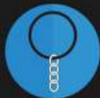
Key Ring With Chain