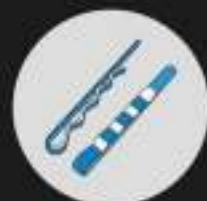
Bobby Pin : 56mm