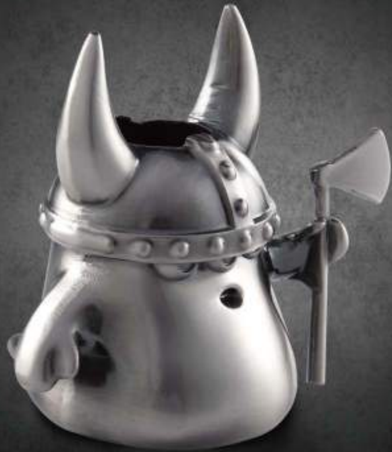
ATD-16 All 3D Products