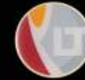
Spot-color printing/ Metal border