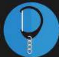
Gate Ring With Chain