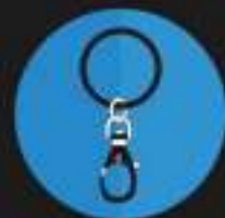
Key Ring With Claw