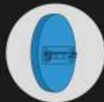
Safety Pins : 15/18/20/26/32/39mm