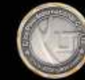
Curve wave edge