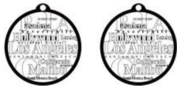
Black and white drawing