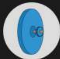
Nut and Screw 7/9mm