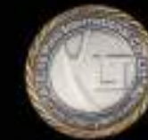
Oblique line edge