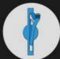
Tie Bar Clip 43/51/55/58mm