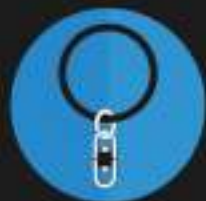
Key Ring With Swivel