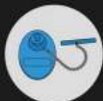
Tie Tack with Chain