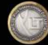
Diamond line edge