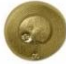
OD28mm w/ sticker