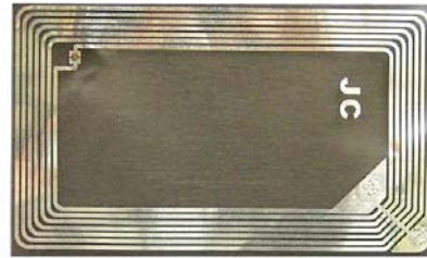
78 x 47mm